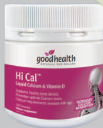
Hi Cal™ Liquid Calcium & Vitamin D