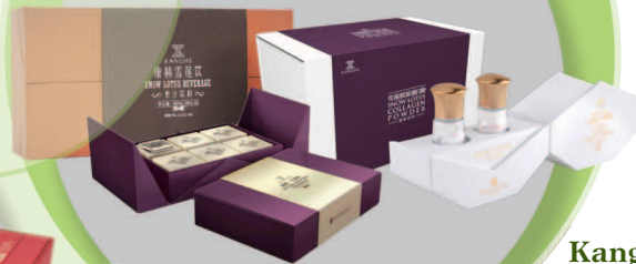
Kanghe Snow Lotus