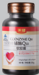
Coenzyme Q 10 Softgel