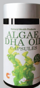
Algae DHA Oil