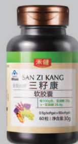
San Zi Kang Softgel