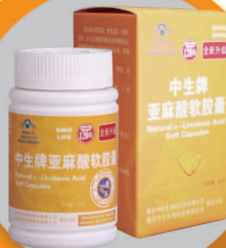
Zhongsheng Branded Linolenic Acid Soft Capsules