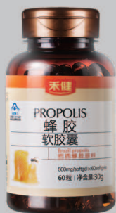
Hejian Propolis Softgel