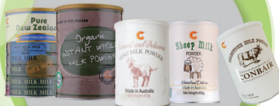
Milk Powder Products