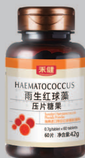
Hejian Haematococcus Pressed Candy