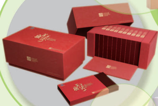
Zhongsheng Branded Antler Ginseng Capsules