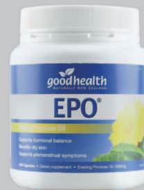
Evening Primrose Oil Capsules