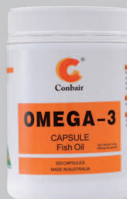
Omega-3 Soft Capsules