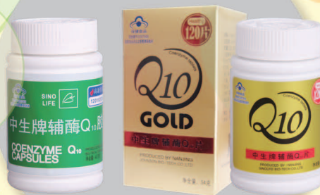
Coenzyme Q 10 Tablet/ Capsules