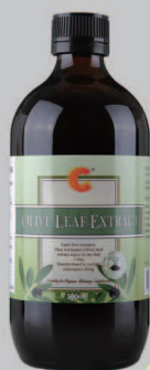
Olive Leaf Extract