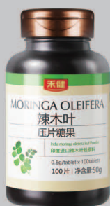
Hejian Moringa Oleifera Pressed Candy